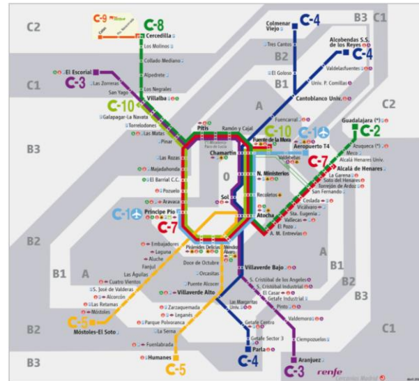
Plano de Cercanías Madrid